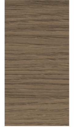
INTERNAL DOOR LAMINATE