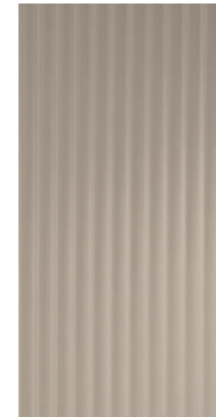
SHOWER, WARDROBE & KITCHEN CABINETS - TINTED GLASS