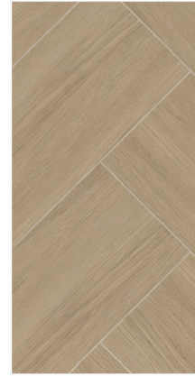
GENERAL FLOOR PORCELAIN TILE HERRINGBONE