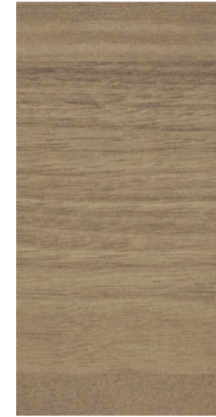
ENTRANCE DOOR VENEER