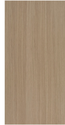
BEDROOM FLOOR ENGINEERED WOOD