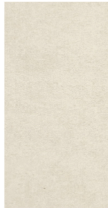
BATHROOM FLOORING & WALLS PORCELAIN TILE