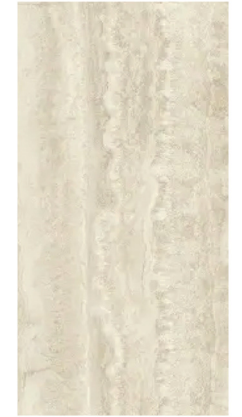
KITCHEN ISLAND & VANITY ENGINEERED STONE