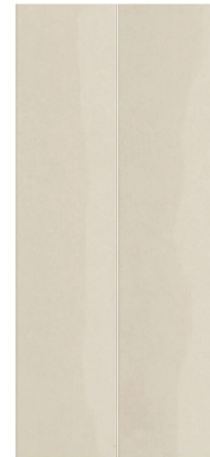
BATHROOM FEATURE WALL CERAMIC TILE